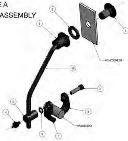
FIGURE A UPPER MOUNT ASSEMBLY